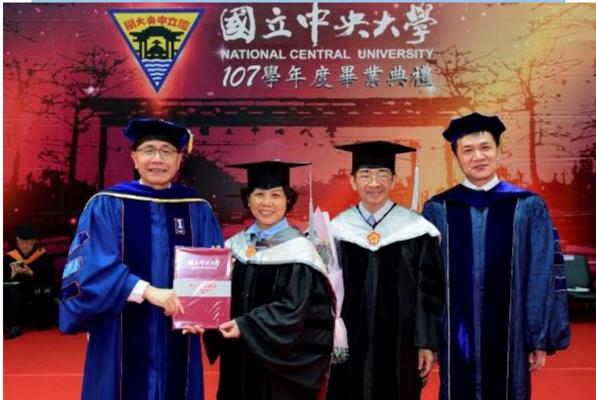
左1: President 右二: Co-author + Advising professor 右一: Vice President ERP Secretary